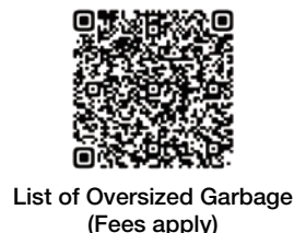
List of Oversized Garbage (Fees apply)