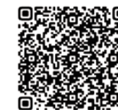
How to Dispose of TVs, etc.

Use the QR code on the right to make an online reservation.